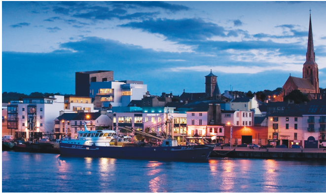
Wexford quay at night

By mid afternoon, we board the coach to continue to Wexford and, in the later afternoon check into rooms at the Talbot Wexford hotel with time to refresh and dress in style for the Opening Night dinner at the O'Reilly Theatre and 8:00pm Herculanum . After, we join the cast, company, Friends and benefactors for a festive conclusion to the evening at Greenacres Restaurant.