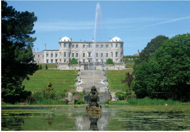
Fountain at Powerscourt Estate

in beautiful County Wicklow, known as The Garden of Ireland, with a tour of Glendalough, a visit to Avoca, Avondale's Parnell House and the splendid Powerscourt Estate.