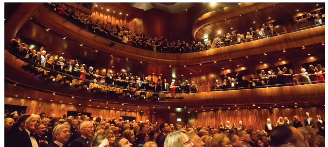
Wexford National Opera House

Dress Code: Black Tie for Wexford Evenings