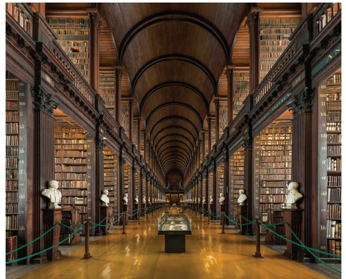
Long Room, Old Library, Trinity College, Dublin

After a full Irish breakfast (included daily) meet and walk to nearby Trinity College, where we will visit the Long Library and view the Book of Kells. We then continue to the National Gallery of Ireland for a curated tour. Oscar Wilde's house is nearby (it currently belongs to The American College in Dublin) and a visit will be arranged for our party. Lunch is independent today. There are many choices in the vicinity and suggestions will be given. The rest of the day is at leisure. An evening theater performance will be included, subject to the announcement of plays held over after the Dublin Theatre Festival (may be alternated with Tuesday, depending upon scheduling).