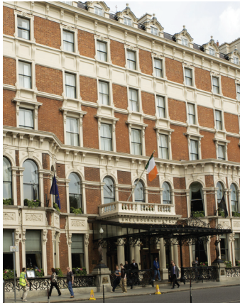
Shelbourne Hotel, Dublin

The Shelbourne Hotel located in the heart of the city on St. Stephen's Green is within an easy stroll to the leading cultural, historical and leisure attractions. The 4 star Talbot Hotel, ideally located in the heart of Wexford close to the quay, is one of the best hotels in Wexford. Powerscourt Hotel is a 5 star luxury property on the Powerscourt Estate, close to the picturesque village of Enniskerry, Co. Wicklow.